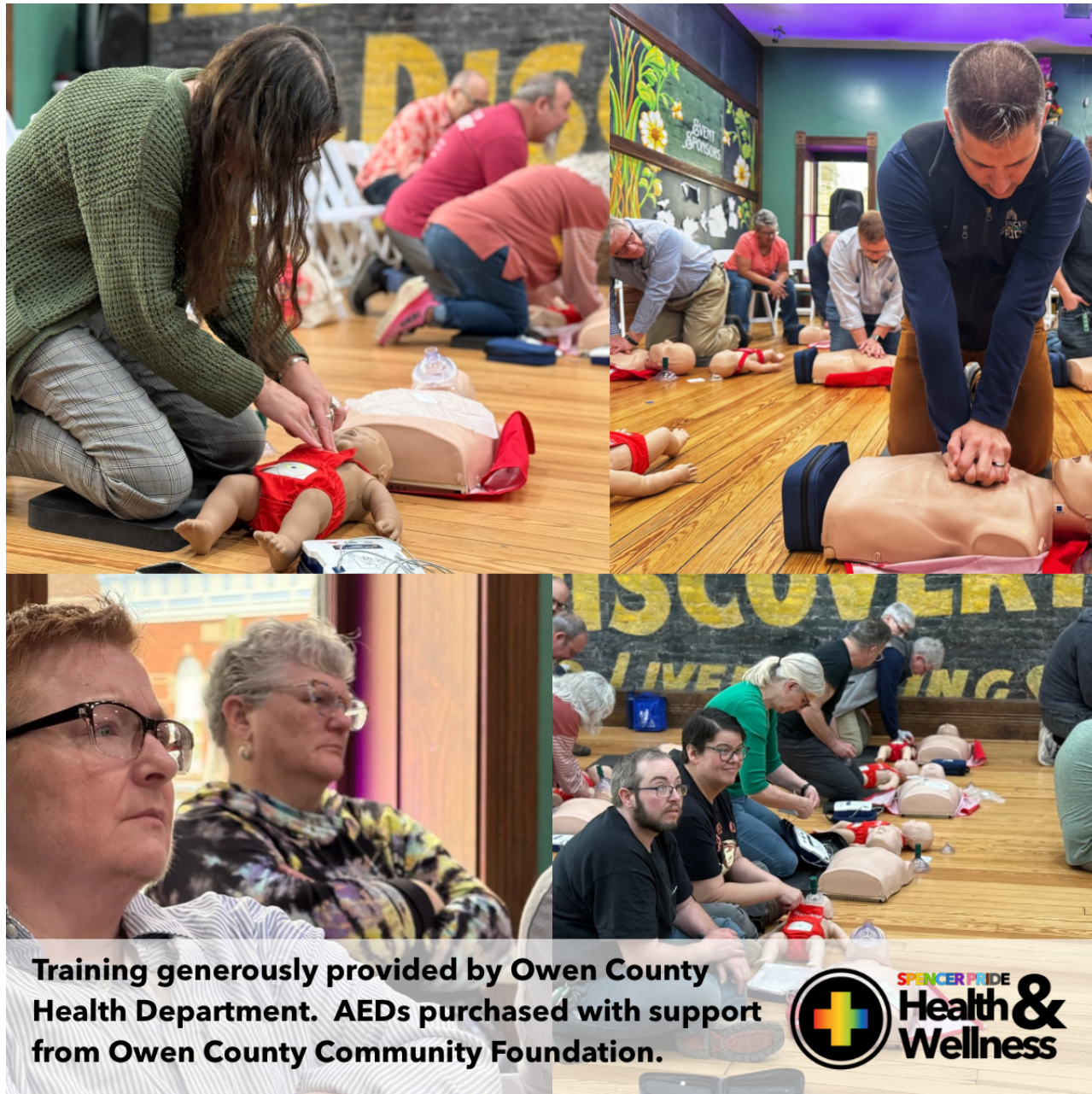
Training generously provided by Owen County Health Department. AEDs purchased with support from Owen County Community Foundation.