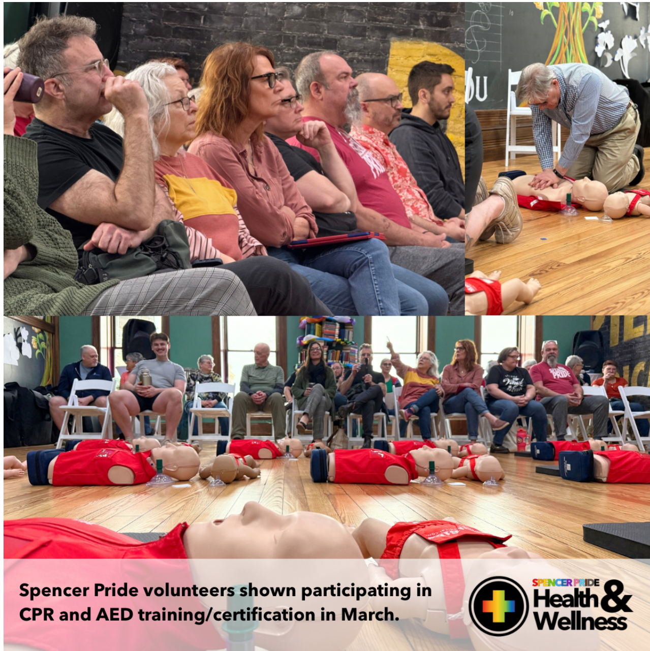
Spencer Pride volunteers shown participating in CPR and AED training/certification in March.